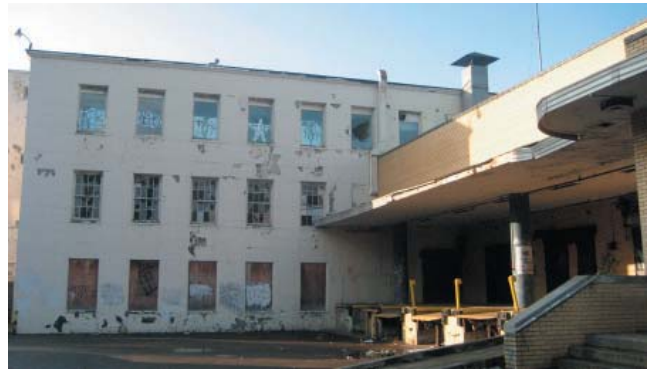
With nearly 80-thousand in county brownfield cleanup funds and nearly a half a million in Restore NY funds, this eyesore in Johnson City will hopefully be demolished soon.

molition project in Johnson City and in the coming months, more of these dollars are expected to be utilized remediating parts of the Brandywine Corridor.