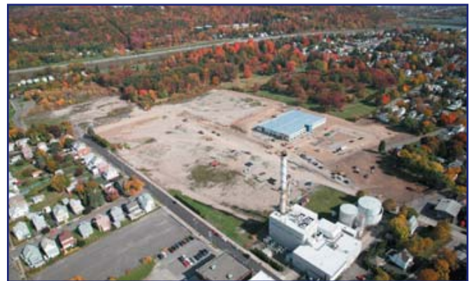
"Emerson Network Power's new Binghamton headquarters under construction in the Charles St. Business Park."

Emerson Network Power, a business of Emerson, is near completion of a 40,000 square foot headquarters in the Charles Street Business Park in Binghamton. This world-class facility will host visitors from around the world and showcase Emerson Network Power's global-leading technologies in power protection. The company expects to occupy the building in January, 2009. The Charles Street Business Park has land available for companies seeking to expand or relocate. The Park is in the Empire Zone and in the HUB Zone. Please contact the IDA at 607.584.9000 for more information.