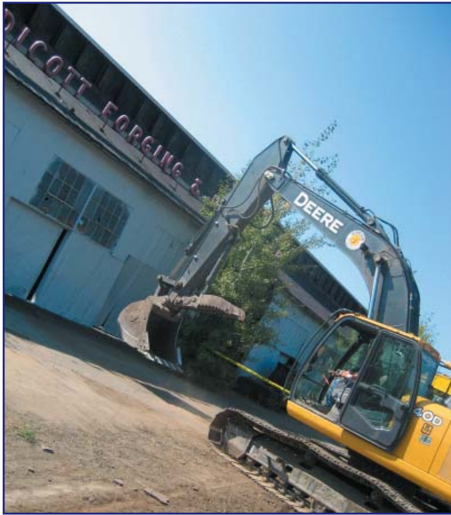
Demolition work began in September at the site of the former Endicott Forging manufacturing facility.

If you have traveled on North St. in Endicott recently, you will have noticed that the landscape has changed rather dramatically in the last few weeks. The former Endicott Forging buildings are finally being reduced to rubble. The project got started September 23rd and major progress has been achieved in the ensuing days.